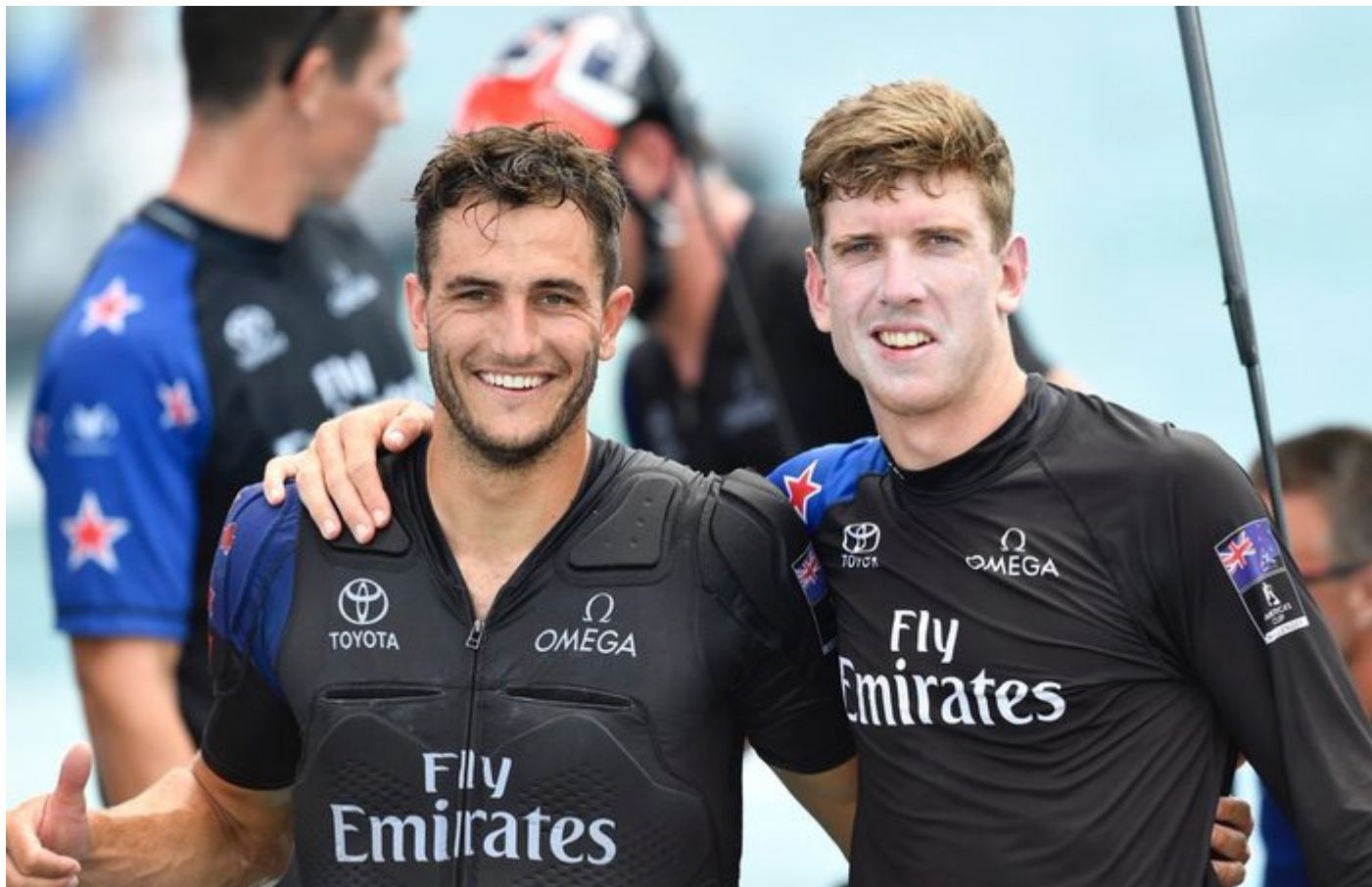
Team New Zealand's Blair Tuke, left, and Peter Burling after this morning's win in Bermuda.

"We're on top of the world." Team New Zealand helmsman Peter Burling, 26 - the youngest person to win the race for the America's Cup - put it nicely after comfortably beating Oracle Team USA in the dash for the Auld Mug today.