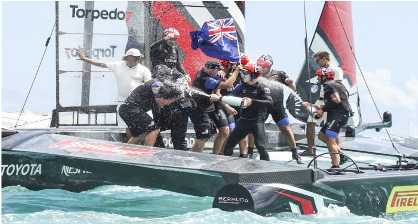
Team New Zealand celebrates the America's Cup victory in Bermuda.