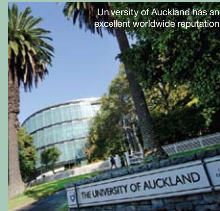
University of Auckland has an excellent worldwide reputation

For job and salary information visit www.career.govt.nz , also www.workandincome.govt.nz/find-a-job and www.newzealandnow.govt.nz/work-in-nz/nz-jobs-industries .