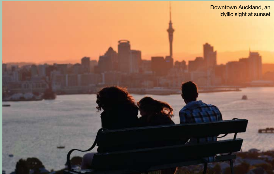
Downtown Auckland, an idyllic sight at sunset

When you arrive in New Zealand and have found a suburb in which you plan to live, then registering with the local doctor should be your next step. There are both Public and Private Hospitals in New