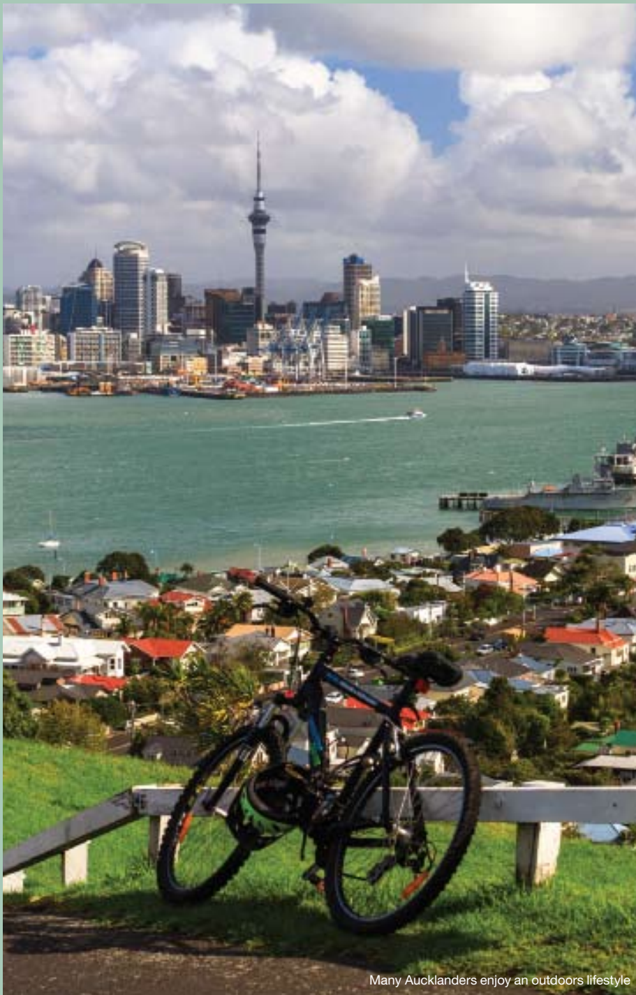
Many Aucklanders enjoy an outdoors lifestyle

Cosmopolitan Auckland attracts many migrants with its relaxed outdoors lifestyle, high quality education and great job opportunities, writes Mary O'Brien