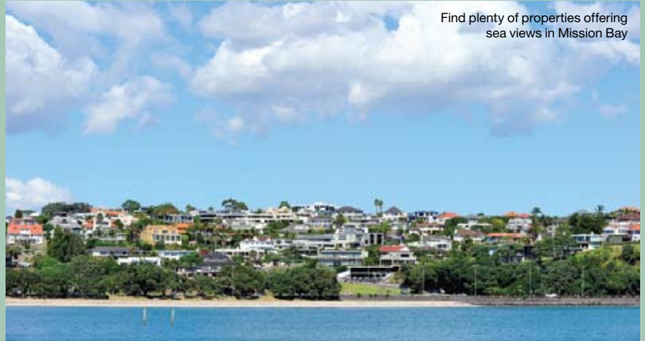
Find plenty of properties offering sea views in Mission Bay

With the new billion dollar expansion to the road system in this area, these suburbs are becoming increasingly popular, especially for those purchasing existing and brand new properties. This is a “green belt” area of Auckland with the Waitakere