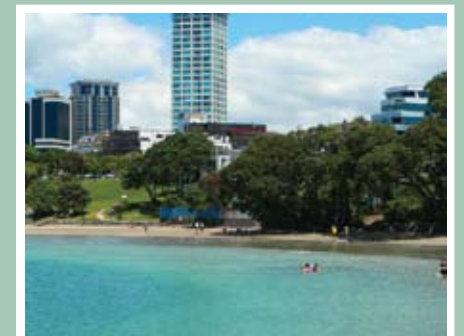
Beachside living in Takapuna