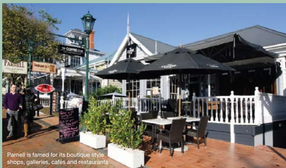
Parnell is famed for its boutique style shops, galleries, cafés and restaurants