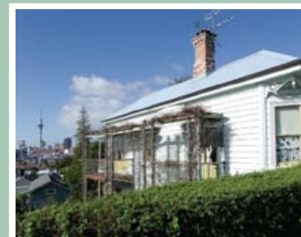
A colonial cottage in Ponsoby

In New Zealand there is no stamp duty, land tax and the legal and registration fees amount to NZ$1,500 (£787).