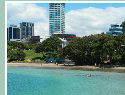
Beachside living in Takapuna