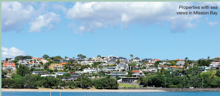
Properties with sea views in Mission Bay

With the new billion dollar expansion to the road system in this area, these suburbs are becoming increasingly popular,