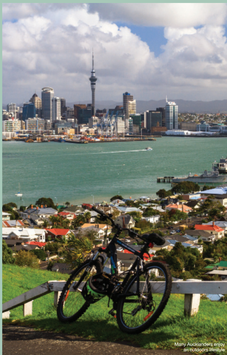
Many Aucklanders enjoy an outdoors lifestyle

'The City of Sails' attracts many migrants with its relaxed outdoors lifestyle, high quality education and great job opportunities, writes Mary O'Brien