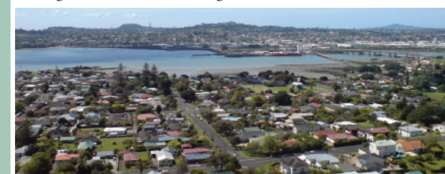
Looking out northwards from Mangere Mountain over Southern Auckland