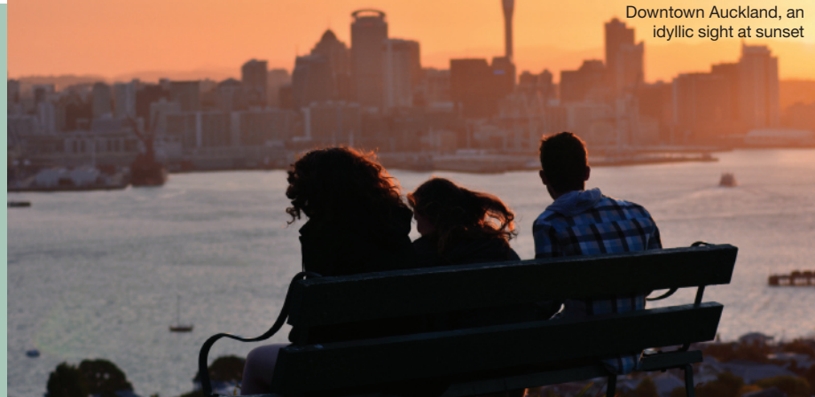
Downtown Auckland, an idyllic sight at sunset