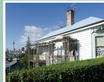
A colonial cottage in Ponsonby

In New Zealand there is no stamp duty, land tax and the legal and registration fees amount to NZ$1,500 (£787). 🇳🇿