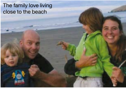
The family love living close to the beach