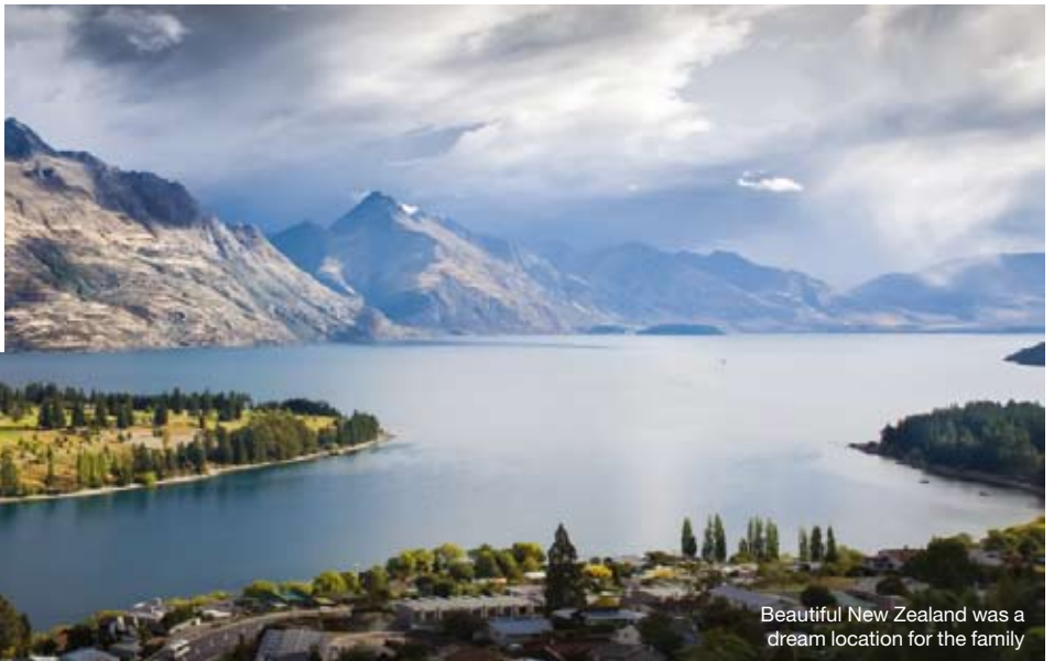
Beautiful New Zealand was a dream location for the family